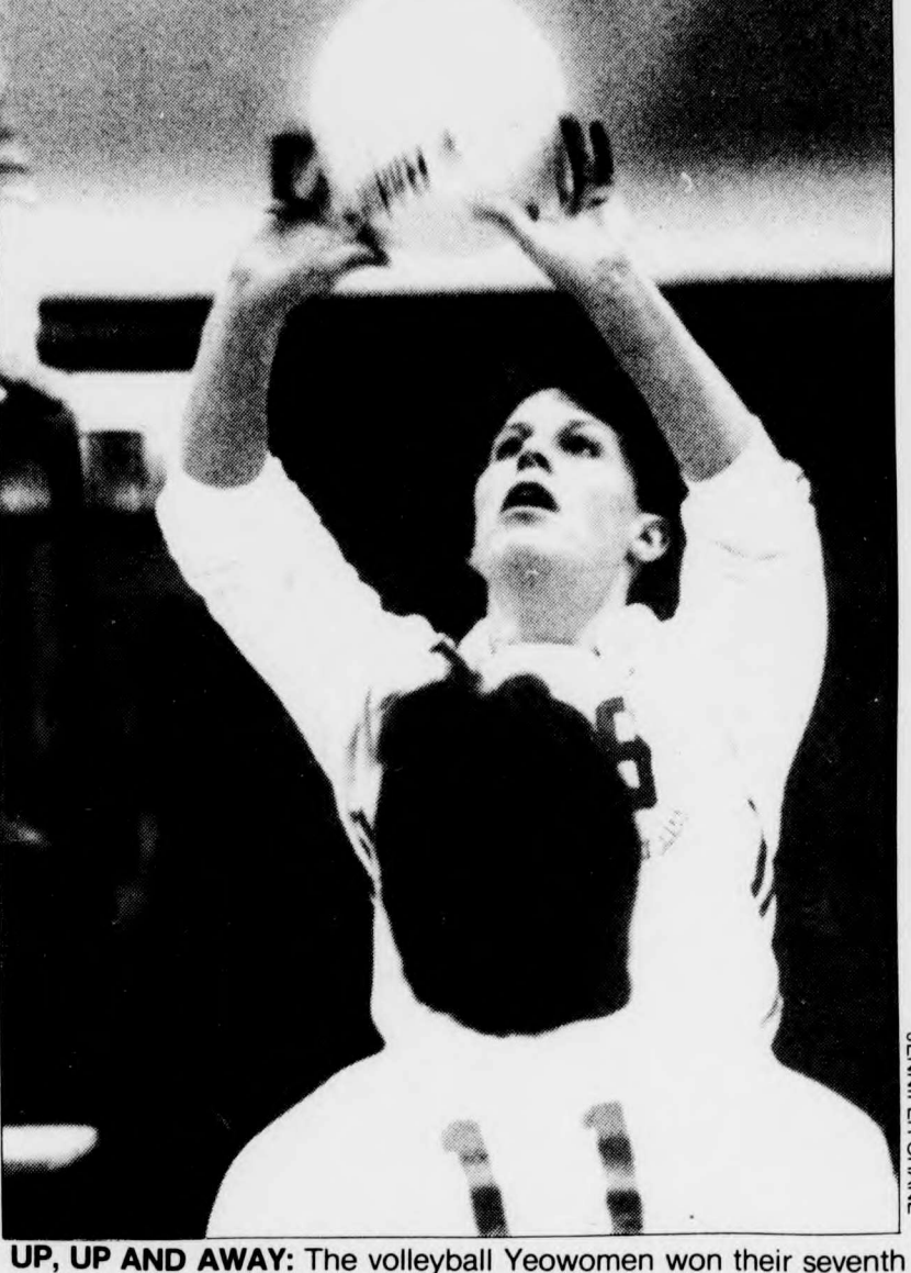
OWIAA championship, but failed to produce nationally. Winnipeg eventually ousted Sherbrooke in the CIAU finals.