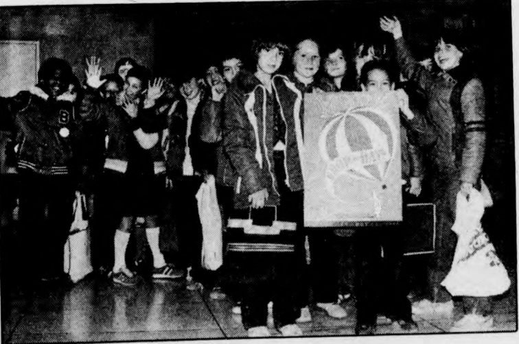
One of the many school groups 'dropping in'

Information on event locations will be available on Saturday morning at the Science Olympics information booth at the main entrance off Keele Street.