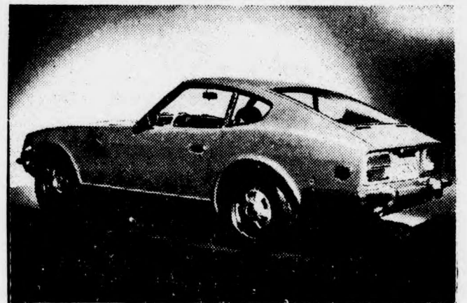
Datsun 240-Z. Given "The Car of the Year Award" by Road Test Magazine.

In Montpellier subscribers to TIP get their key to the Simcas. But they also have to get plastic tokens at local stores; these give the TIP driver eleven miles of driving before another token must be put in the slot. Reaching his destination, the driver leaves the car and goes about his business. Instead of using the same car for the return trip, he merely takes another convenient TIP Simca. Developers of this novel system say they expect to expand worldwide. They see it as contributing to the solution of urban traffic problems and claim one third of all vehicles could be removed from the streets if transportation was restricted to buses, taxis and TIP cars.