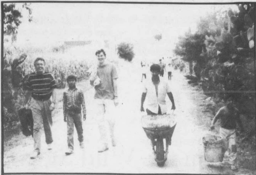
Off to relax and drink (Tequilla? - ed.) after a hard days work.