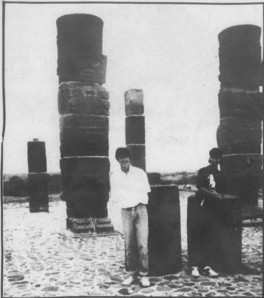
Visiting one of the many interesting historical sites.