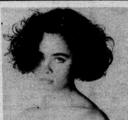
Hair Styles by Sheila Slade