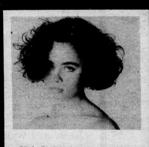
Hair Styles by Sheila Slade