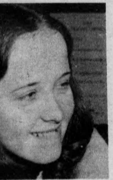
Sci. 3 iss so many meetings lose all or part of their