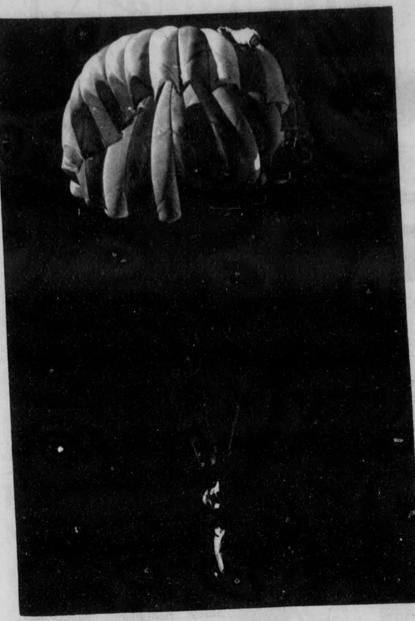
Parajump Meet to be held again

Friday, Saturday and Sunday of Winter Carnival Week, the annual consumer - consumption rates of linament sky-rocket as once again the people of Fredericton crane their necks for a glimpse of the U. N. B. Para-Jump Club as they present what appears to be an annual event - the Winter Carnival Jump. Once more UNB will be host to skydivers from many parts of Canada and the U.S. Jumpers from Mass., Connecticut, Vermont and North-Eastern University, Quebec Parachute Club, Saint John Fundy Skydivers and other clubs will converge on the area for the informal competitions. Trophies are being offered for such proposed events as the hit and run jump-(designed to frustrate non-snow shoe wearing usanians) the automatically disqualifying hitthe-cess-pool-or-drown event - the elm tree-or-bust event - (restricted to "experienced" jumpers) and the hit the football field special.