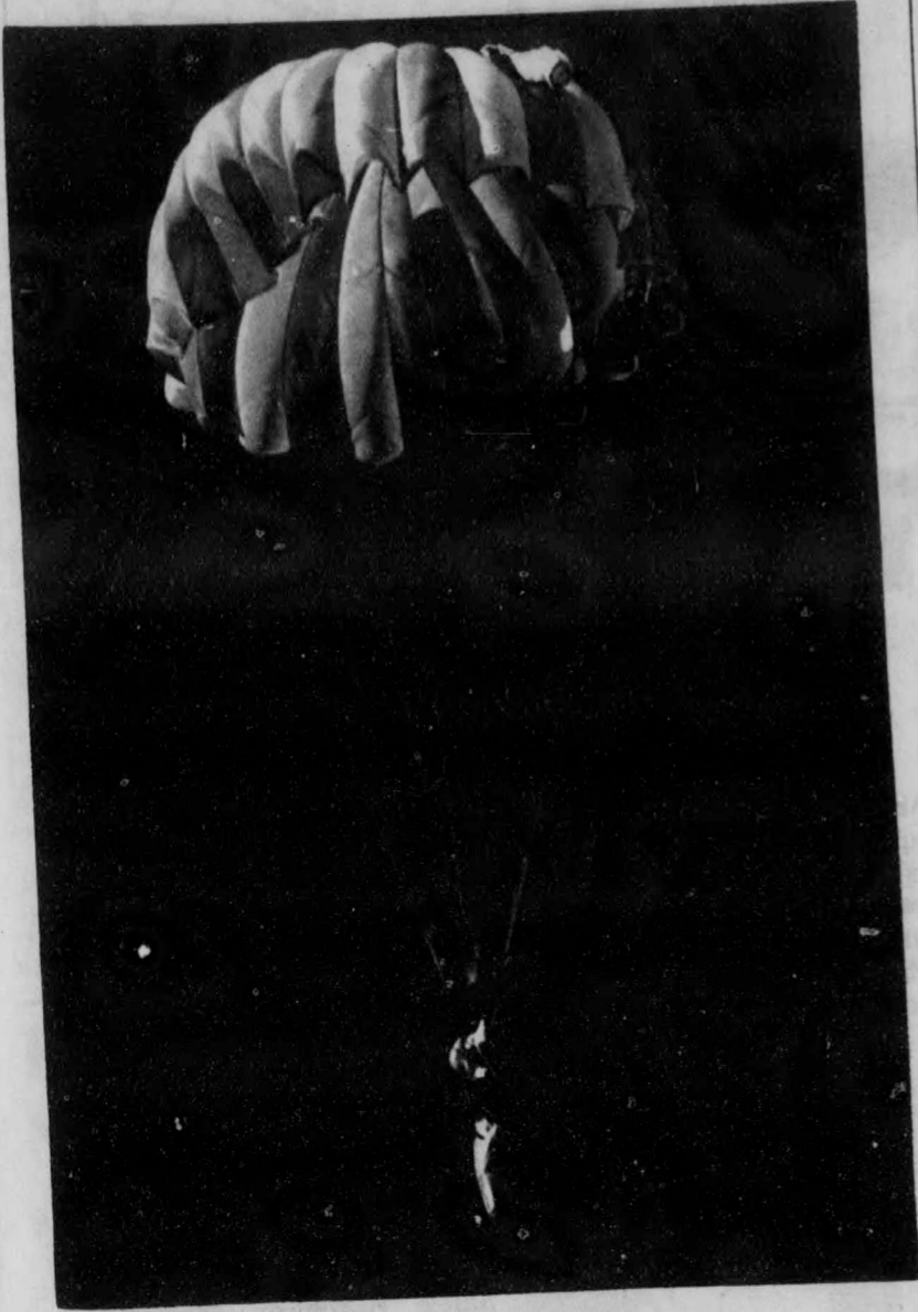
Parajump Meet to be held again

Friday, Saturday and Sunday of Winter Carnival Week, the annual consumer-consumption rates of linament sky-rocket as once again the people of Fredericton crane their necks for a glimpse of the U. N. B. Para-Jump Club as they present what appears to be an annual event — the Winter Carnival Jump. Once more UNB will be host to skydivers from many parts of Canada and the U. S. Jumpers from Mass., Connecticut, Vermont and North-Eastern University, Quebec Parachute Club, Saint John Fundy Skydivers and other clubs will converge on the area for the informal competitions. Trophies are being offered for such proposed events as the hit and run jump—(designed to frustrate non-snow shoe wearing usians) the automatically disqualifying hit-the-cess-pool-or-drown event — the elm tree-or-bust event — (restricted to “experienced” jumpers) and the hit the football field special.