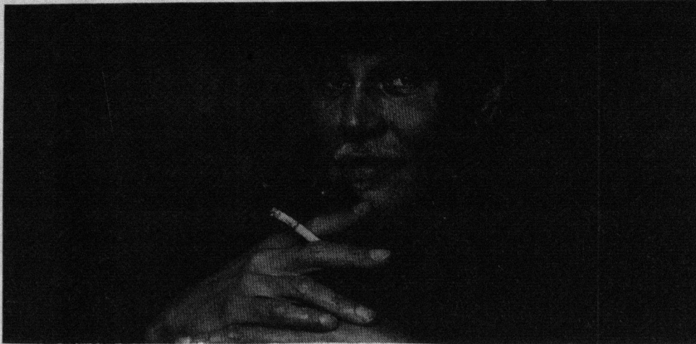
Dexter Gordon, almost 90 years old, master of jazz.