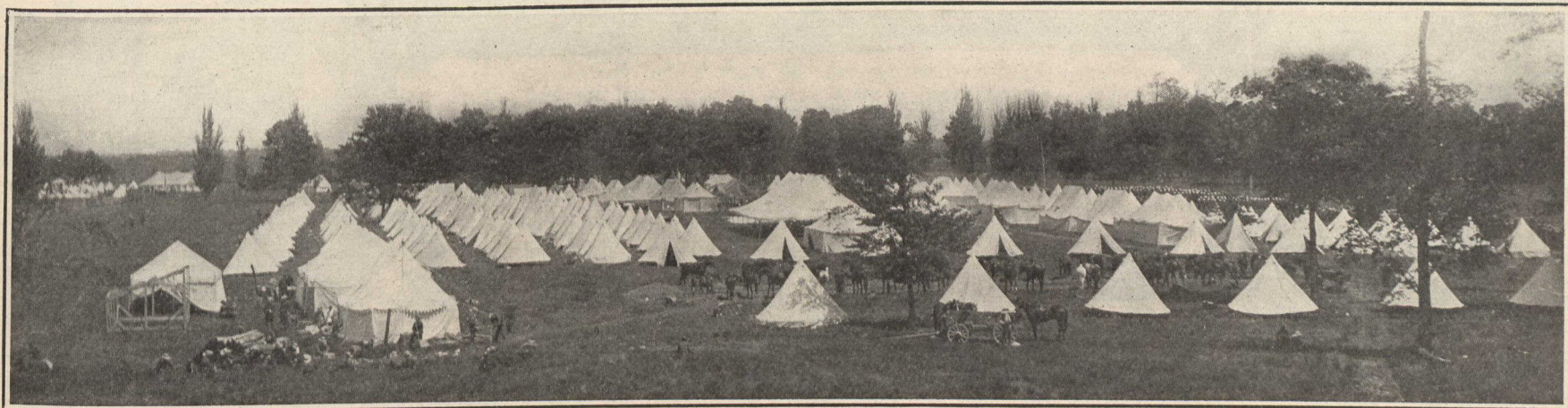
A General View of the Goderich Camp from the Water-Tower