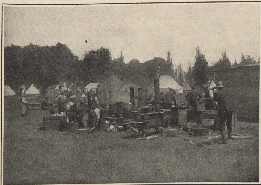
Where the Soldiers' Skilly is Made