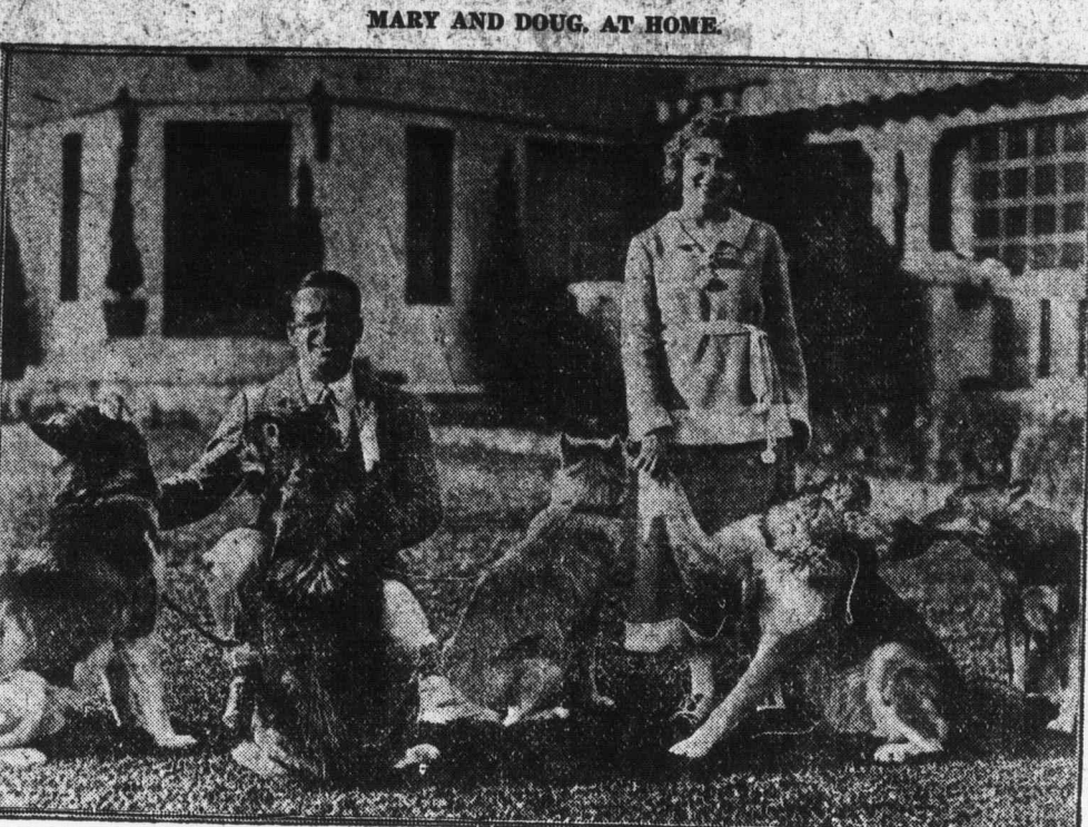
MARY AND DOUG. AT HOME Mr. and Mrs. Douglas Fairbanks on their estate, Berkley Hills, Calif., fondling the Fairbanks thoroughbred dogs. As everyone knows, Mrs. Fairbanks is Mary Pickford of film fame. Their estate is one of the most beautiful in all California.