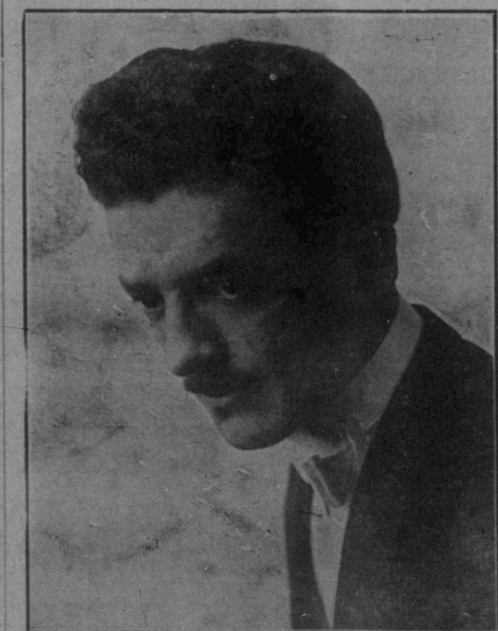
Blackstone, the Magician, Who is the Attraction at the Empire Theatre Next Monday and Tuesday.

the first production ever sent out of New York City embracing every department of baffling magic, mystery and mystic sensation. It has been some time since even a magic show was presented here, and playgoers of this city and vicinity should be ripe for the surprises and revelations which Blackstone promises.