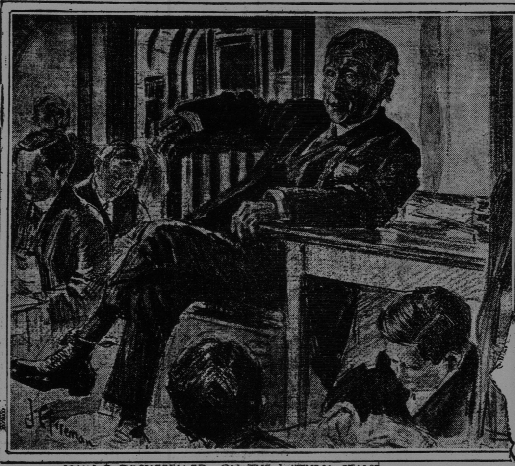
JOHN D. ROCKEFELLER ON THE WITNESS STAND