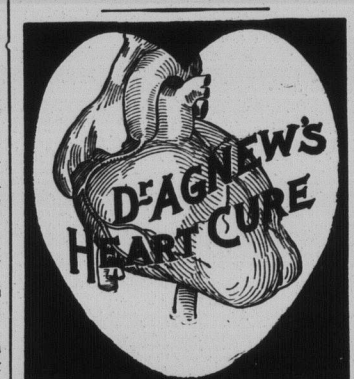
Heart Disease Relieved in 30 Minutes.

The smallest one, however, when the city had long been left behind, felt somewhat uneasy. He rubbed his ponderous stomach with his trunk, and delivered a shrill trumpeting sound which drowned the noise of the big whistle. The captain tried to make a trade for the animal, as he said that his vocal strength far exceeded the powers of the vessel's deep voiced toghorn.