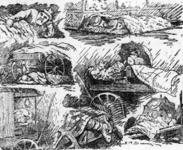
CHATHAM MARKET. As it used to appear every Friday night before rigid stands were sold. Vendors, who came early to secure good stands, sleeping on the market.

Wood's Great Peppermint Cure is a medicine discovered in the West Indies. It is a cure for all kinds of colds, coughs, and bronchitis.