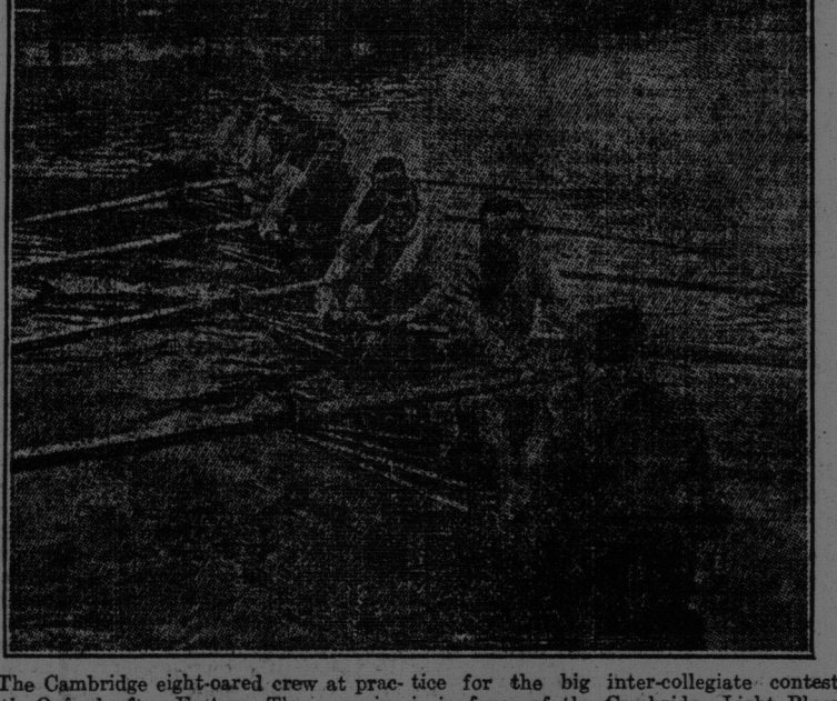
The Cambridge eight-oared crew at practice for the big inter-collegiate contest with Oxford after Easter. The wagering is in favor of the Cambridge Light Blues this year, and this is the crew picked to win. G. E. Tower of Third Trinity College rows the stroke seat and L. E. Rid-ley of Jesus' College is coxswain.