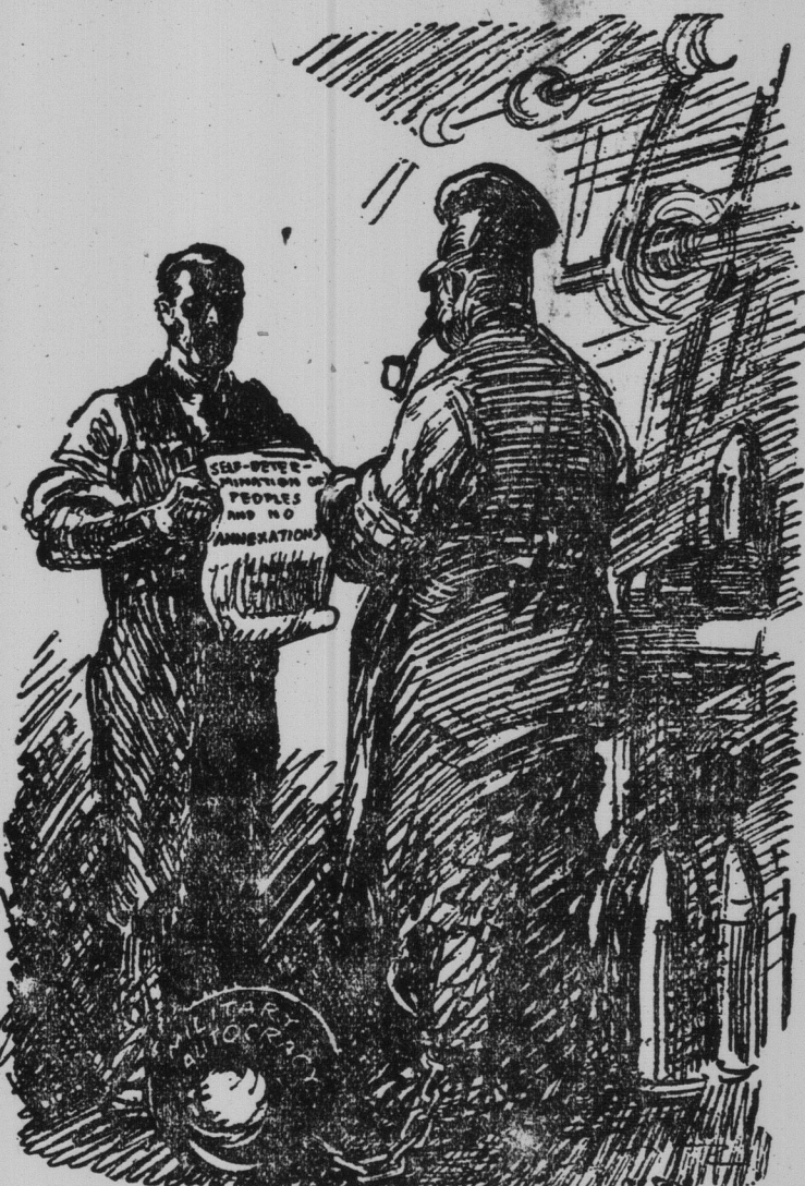
BRITISH LABOR TO GERMAN LABOR "We adjure the people of Central Europe to declare themselves."