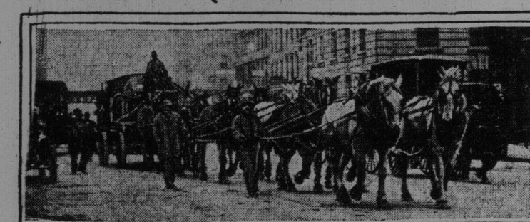
Hauling the Meteorite to the Museum