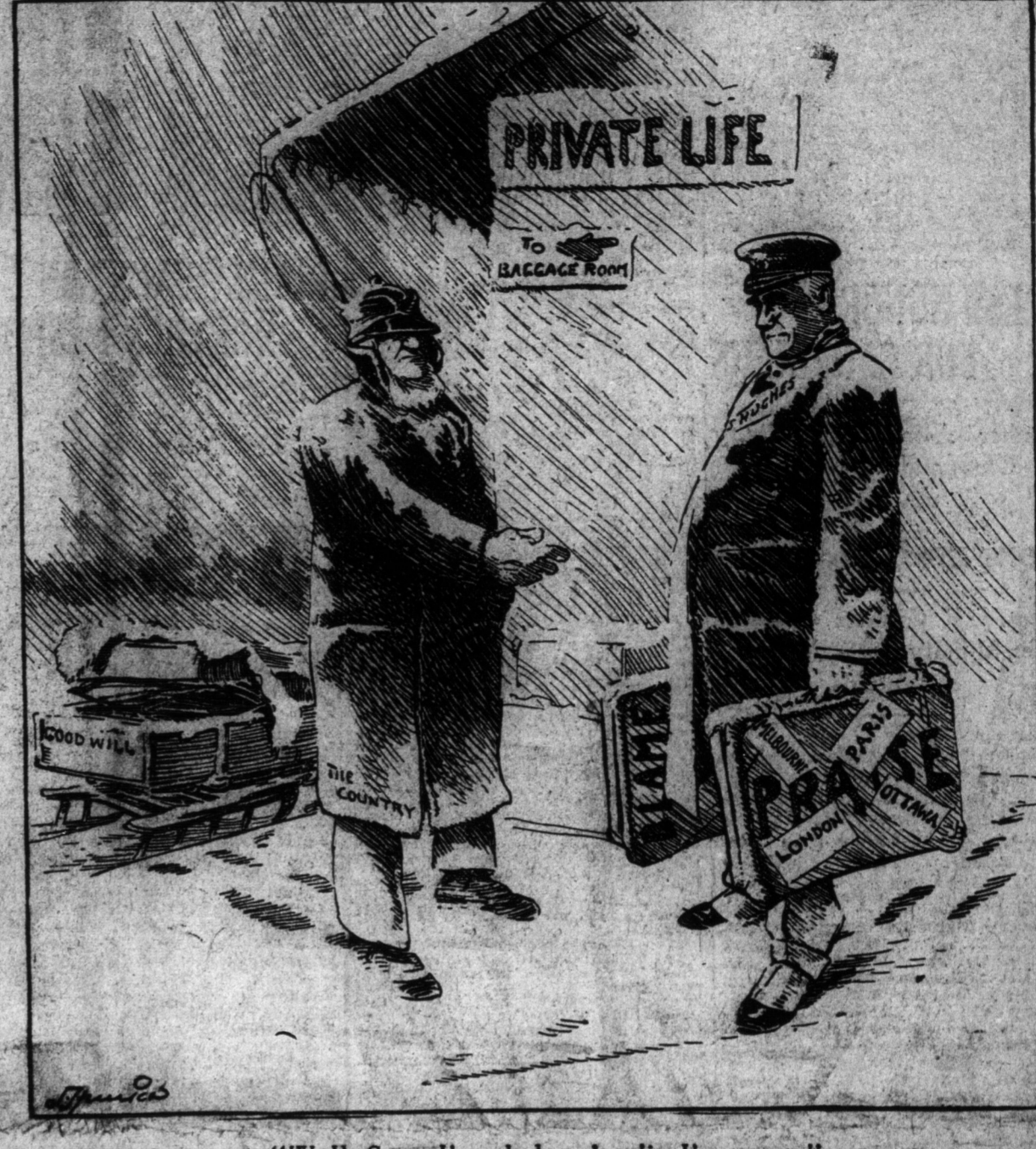
'Well, Sam, I'm glad, an' ag'in I'm sorry.'

BELGIANS TO BE ROUNDED UP ON GIGANTIC SCALE Three Hundred Thousand Will Be Taken Into Slavery.