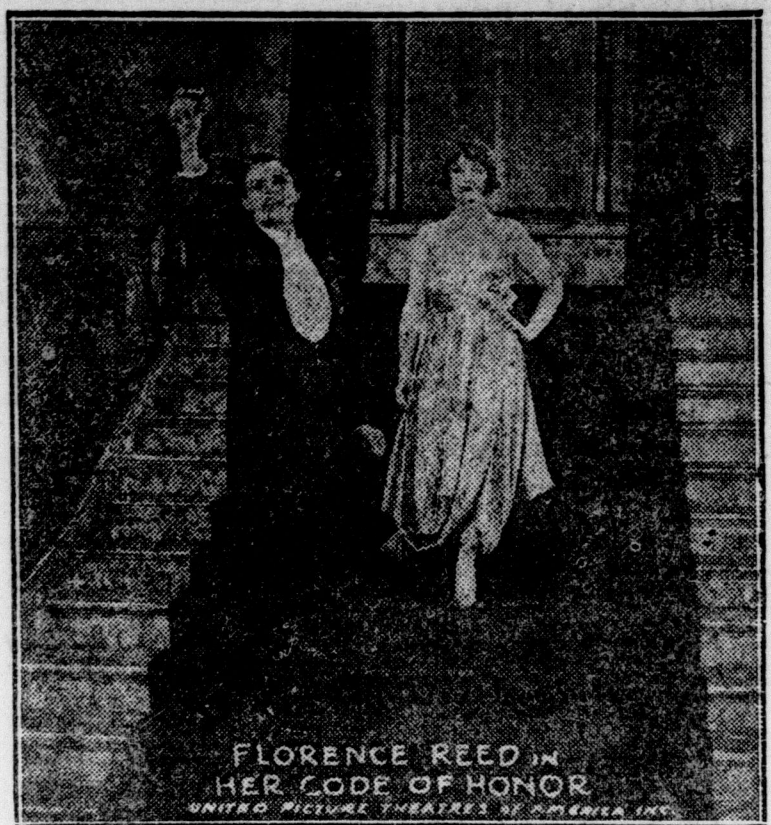
FLORENCE REED IN HER CODE OF HONOR Showing at the Patricia Theatre today, Friday and Saturday. Also Joe Martin, the trained monkey, in "Monkey Stuff"; a Mutt and Jeff comedy cartoon, "The Shell Game"; and the Melani Five, singers and instrumentalists, in vaudeville.

For free sample of Cuticura Soap, Ointment and Talcum, and full directions, Dept. A, Boston, U. S. A. Sold everywhere.