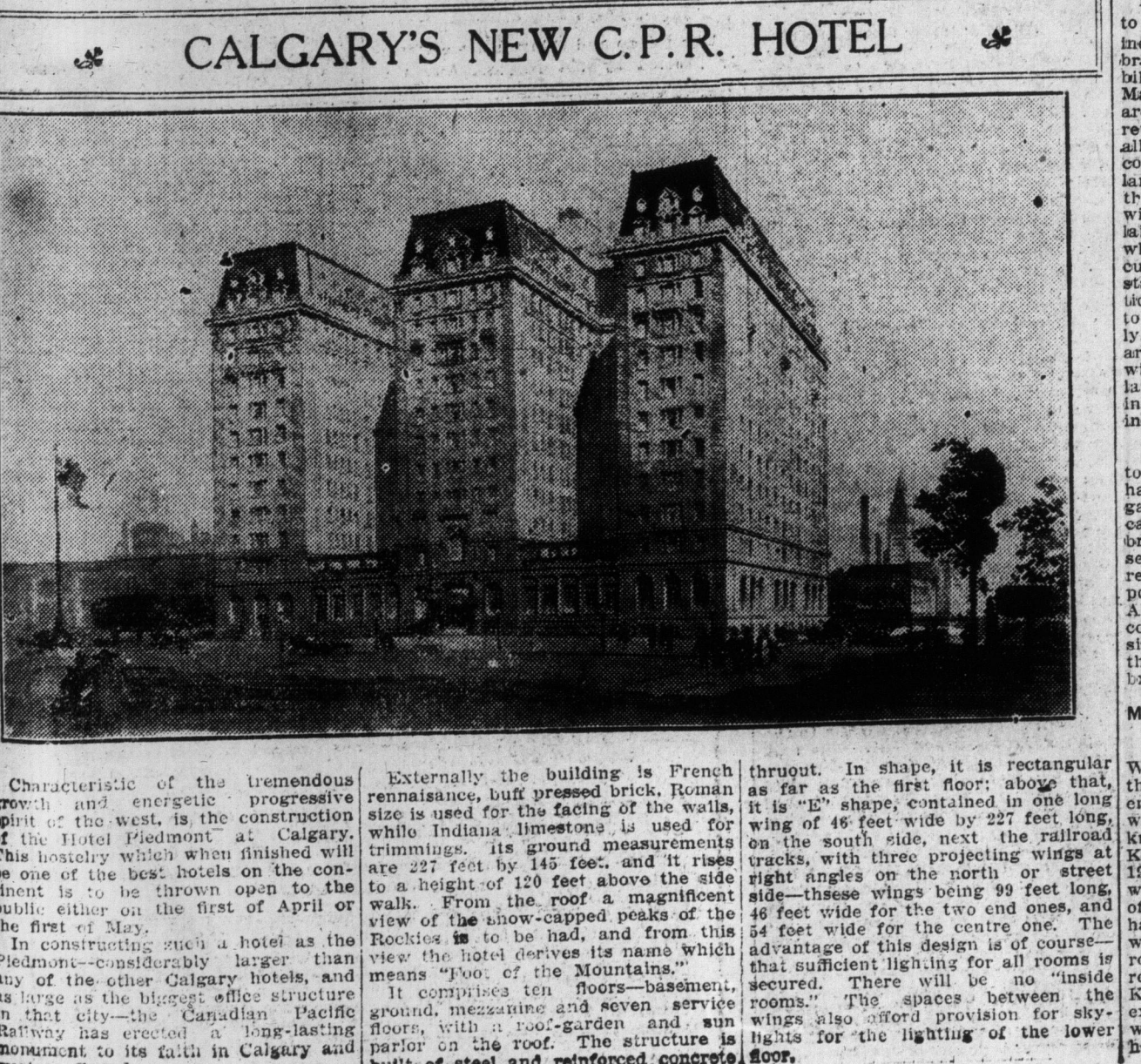
CALGARY'S NEW C.P.R. HOTEL