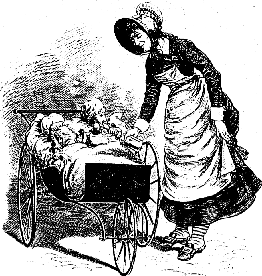
TURN ABOUT IS FAIR PLAY.

THIS PAPER MAY BE FOUND ON FILE AT GEO. P. ROWELL & CO'S NEWSPAPER ADVERTISING BUREAU (10 SPRUCE STREET), WHERE ADVERTISING CONTRACTS may be made for it in NEW YORK.