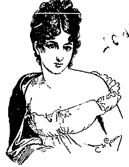
BEAUTY, HEALTH AND HAPPI

are priceless possessions in women, and they can only be preserved by the use of the most carefully compounded toilets and medical Remember that the positive purity, harmlessness and high quality of the ingre-dients of the Recamier toilet Preparations are guaranteed by distinguished and honourable searching analysis.