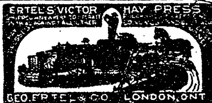
ERTEL'S VICTOR HAY PRESS GEO. ERTEL & CO. LONDON, ONT.

Send for circular to CREAMER CO., Box 552, Brampton, Ont.