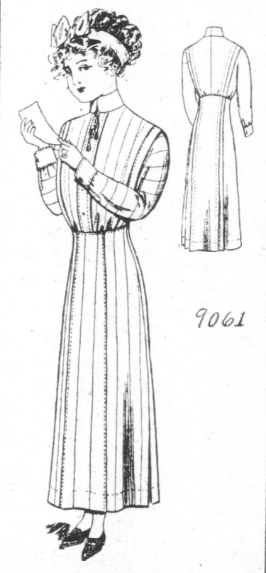
Shirt Waist Suit for Misses and Small Women.

Blue serge with a fine hairline stripe of white was used for this model, which consists of a plain shirt waist and a gored skirt, that may be finish- ed with a high or regulation waist- line. The body of the waist is cut in one with the sleeve. The Pattern is cut in 5 sizes: 14, 15, 16, 17 and 18 years. It requires 6 1/2 yards of 27 inch material for the 15 year size.