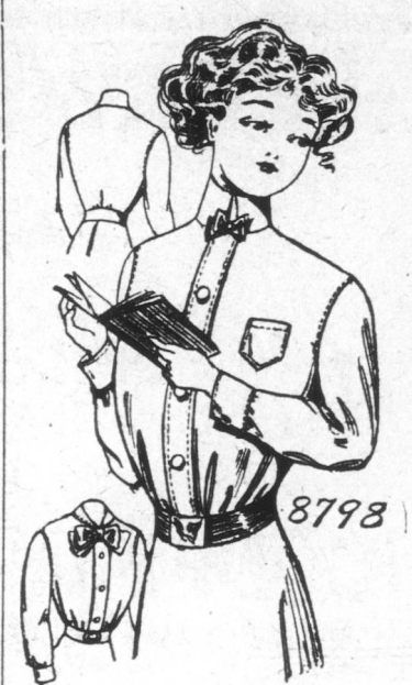
Ladies' Shirt Waist.

The prominent features of this de- sign is the long shoulder and the "manish" finish of the sleeve which is set into the armhole without any fullness. The waist is plain over its upper part. It may be finished with a low or high collar. The pattern is cut in 6 sizes: 32, 34, 36, 38, 40 and 42 inches bust measure. It requires 2 1/2 yards of 27 inch material for the 36 inch size.