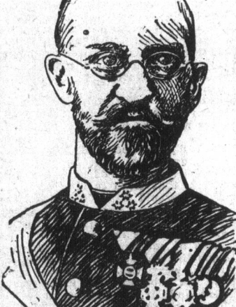
DUKE OF CUMBERLAND.

The story of this historic feud is now such comparatively ancient history that its details may have been forgotten by most people. It may not be