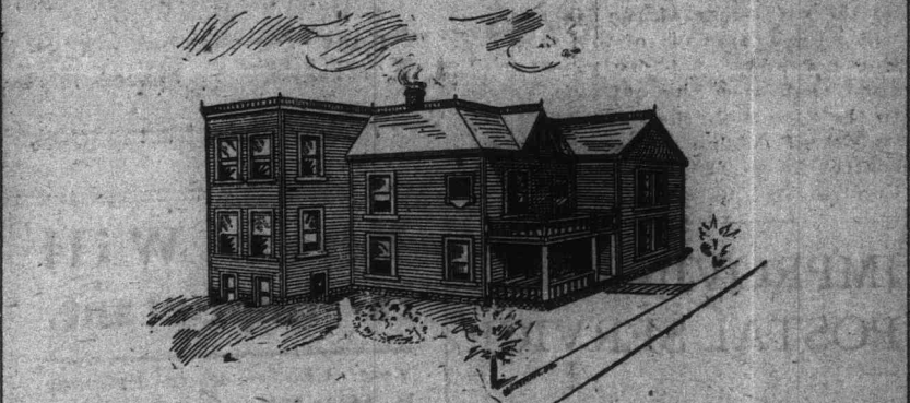
PARK SANITORIUM—Angus Street, (North.)