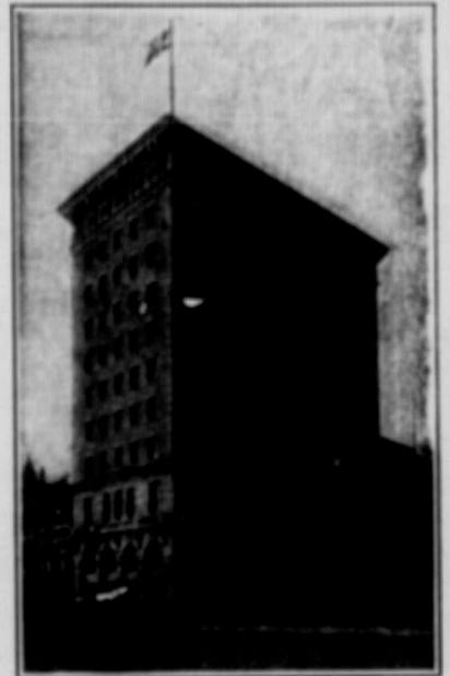
Head Office, Winnipeg