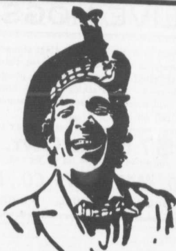
Harry Lauder Makes Records for