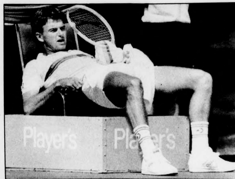
Clockwise from the left: Kevin Curren demonstrates his wicked serve, Mark Woodforde uses the two-handed approach and Jimmy Connors shows his age.