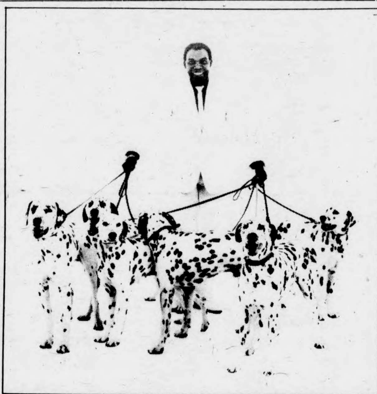
Dekker auditions for Disney film, "The Dread Wore Tennis Shoes".

The album's weak points come when he slides too much into the harmless waters of middle of the road, as on a couple of songs on side two, but he quickly snaps back and finds the cutting edge that gives his pop unrestrained depth, imagination and force.