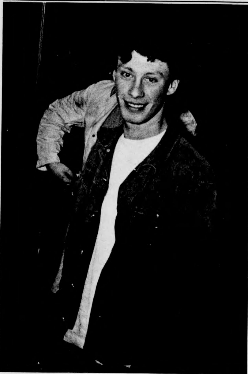
A happy worker smiles for the camera, after accepting a wage offer he didn't expect. Like others, he thought he'd have to strike today.