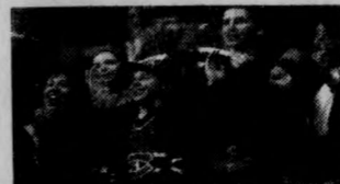
You can have a closer view of the NHL action than these fans with A Day in the Life of the NHL .

Ever dream about what it would be like to be a pro hockey player? Or maybe have an all-access pass to the games, including behind the scenes?