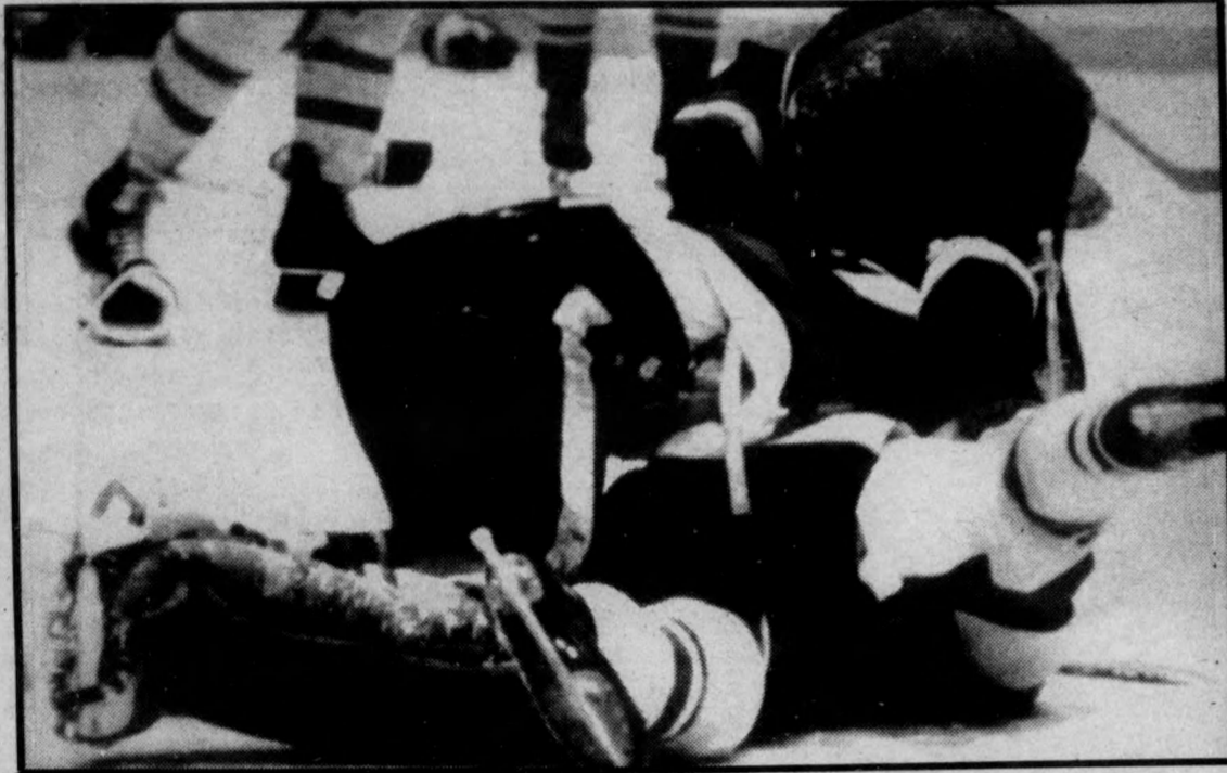
That's right fans. Get ready again for the great Canadian pastime. Wrestling ... I mean hockey. Whether you're playing, coaching, or just watching, hockey is one of the most exciting sports in the world.