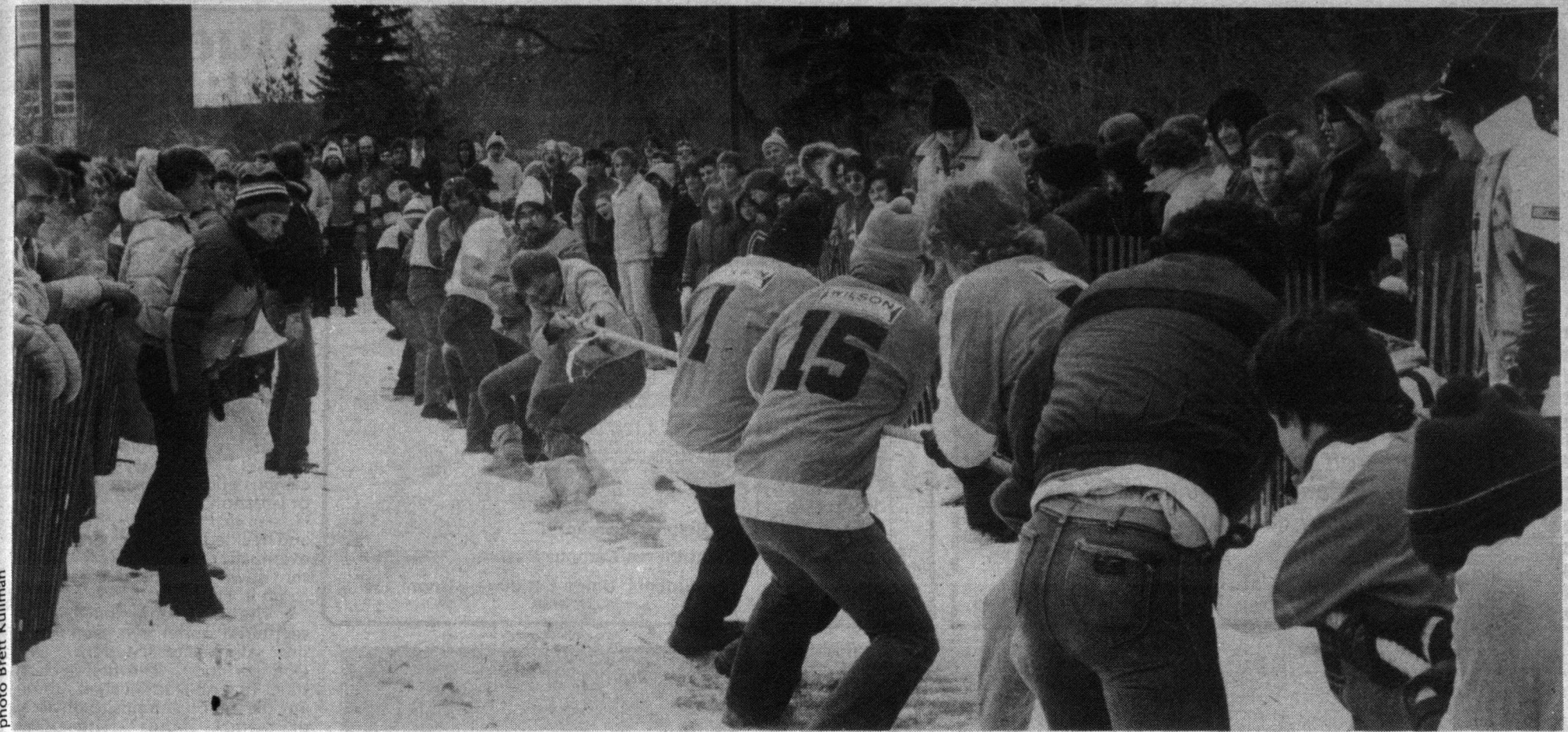
Engineering Week started off in a big way yesterday with the traditional tug of war in quad.