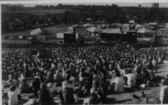
Thousands attended this year's Folk Music Festival