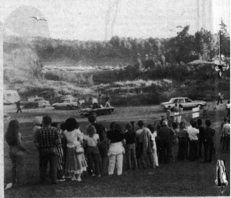
This is an example of the crowds that visited the Valley Tent