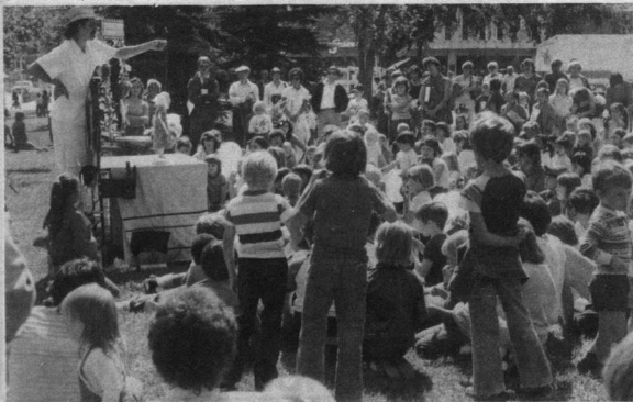
The kids loved the puppets