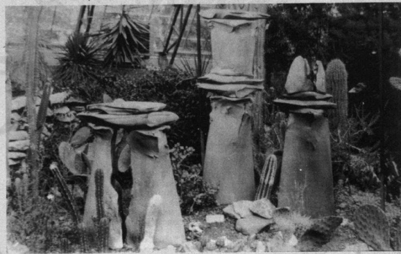
Clay and Glass at the Muttart