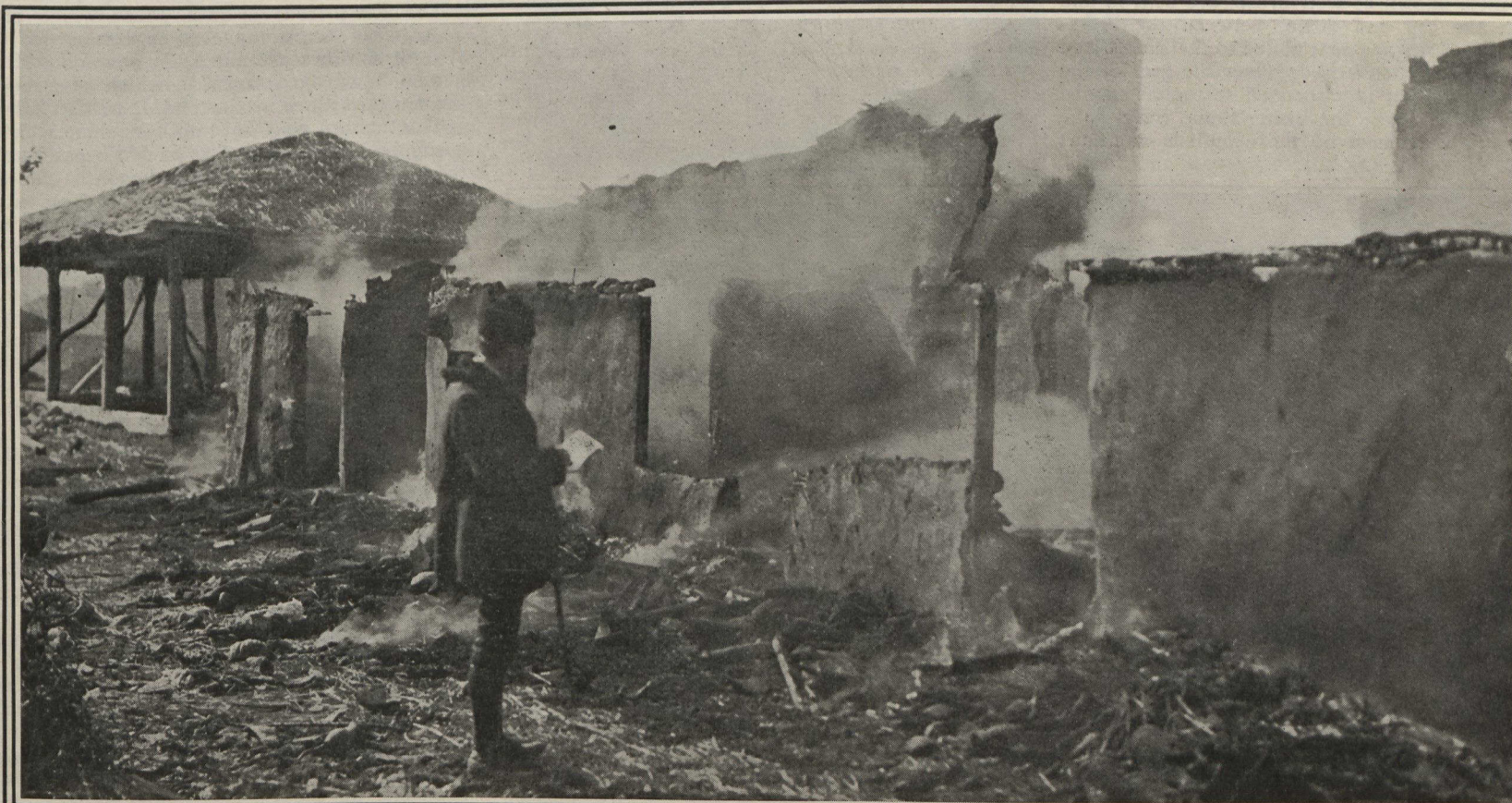
A Turkish Hamlet After Bombardment, Pillage and Fire. This Scene of Desolation Shows the Terrible Results of Turkey's Inability to Govern its Territory and its Unpreparedness for Self-defence.