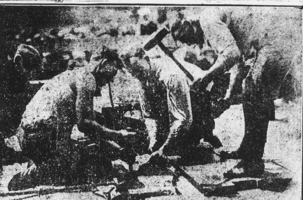
Competitors are shown in the hand-drilling contest at Cobalt, which was one of the many features of the O.J. Boy's Reunion held in the northern mining town recently.

"Why," he exclaimed, "it's the most complete in the country. They have an eye specialist, a throat specialist, a nose specialist, and they even have internes for internal diseases."