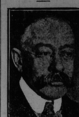
ATTY. GEN. WICKERSHAM.

Fair Plaintiff at Toronto Wins Case Tried in Record Time The Standard Oil Co. is attacked as "holding company;" the American Tobacco Co. as both a holding and an operating company. In the tobacco trust case it is alleged that originally when the merg-