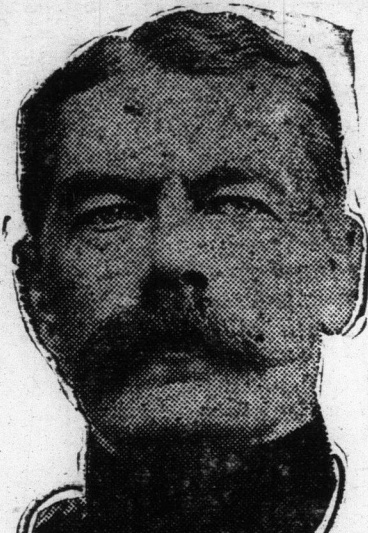
arl Kitchener, Britain's War