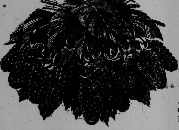
The finest berry flavors