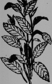
Mint For mint jell

Try several flavors, they will be a revelation.