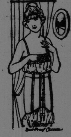
This model with all around elastic top and lightly boned is an inexpensive style for average figures who do not want a heavy corset. Style 42