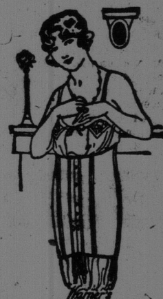
A standard popular-priced, low-bust corset, well boned for average figures. Long skirt with large 5-inch elastic gore in lower back of skirt. Style 18

EVERY PAIR GUARANTEED Not to Rust, Break or Tear