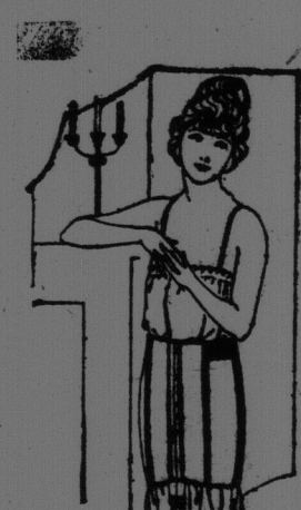
A low-priced, small model, particularly designed for girls and slender women, with elastic gore in bust. Style 83

the Warner Brothers Company—Montreal, P. Q.