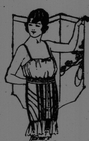
For the full figure or larger woman, this model with medium height bust is especially suitable. It is reinforced over the front and strongly boned throughout. A leader among reasonably priced corsets for larger women. Style 134