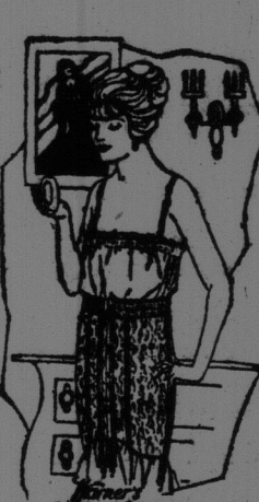
A particularly attractive pink brocade model with all around fancy elastic top, and special hose supporters. For average figures, and exceptionally good value. Style 584