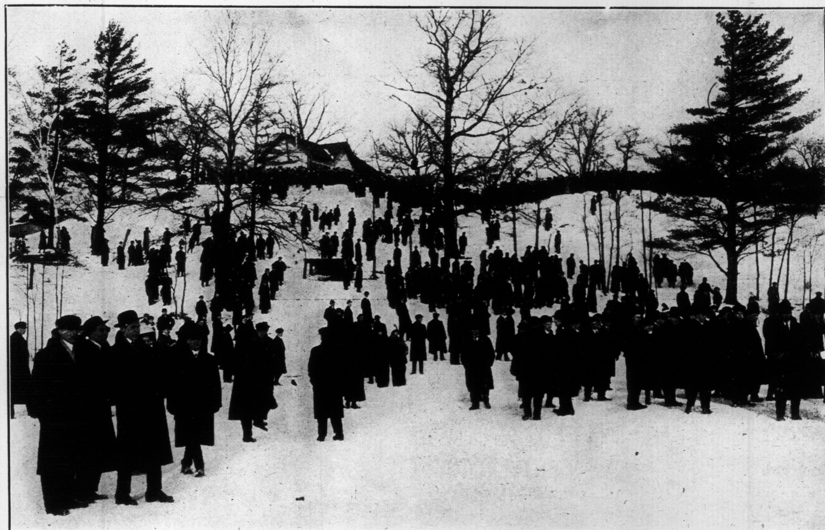
THE IMMENSE CROWDS THAT EVERY FINE SUNDAY LINE THE SIDES AND TOPS OF HIGH PARK'S HILLS. MAY NOT USE THE TOBOGGAN SLIDES, BUT A TOLERANT TRIBUNAL OF FORTY WILL ALLOW THEM TO GET THRILLS OUT OF THE FEATS OF SKI-FLIERS.