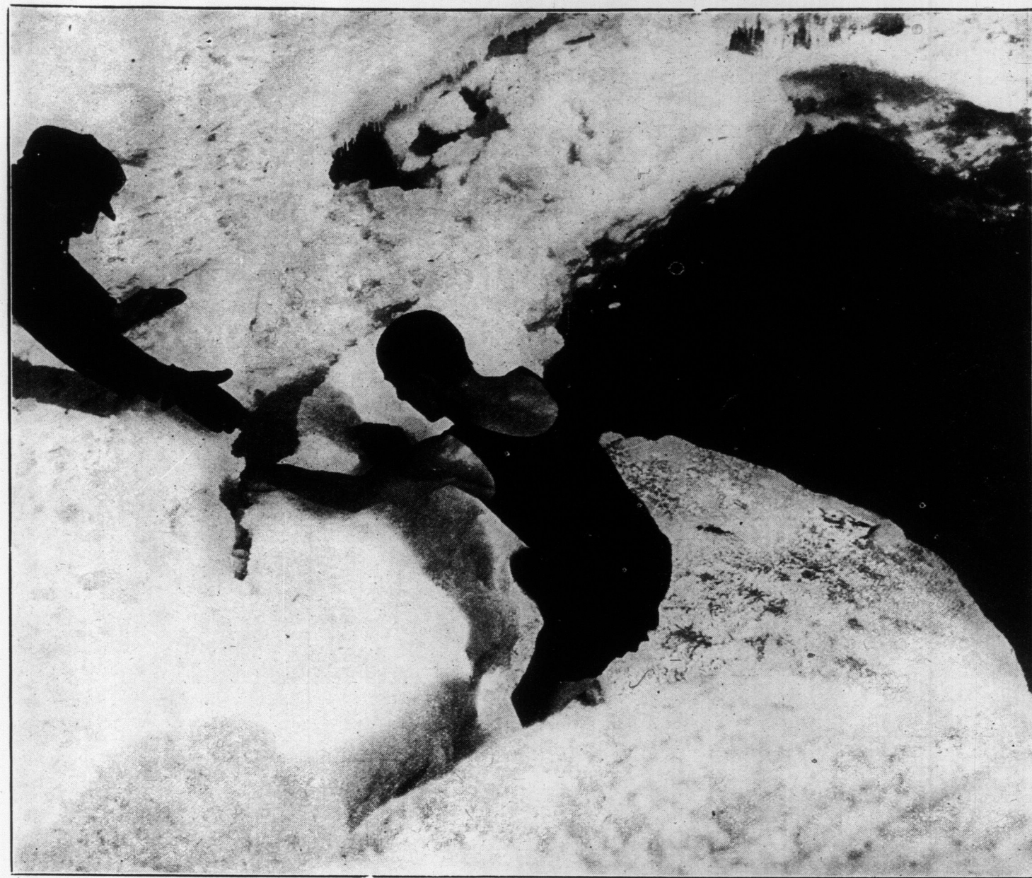
Clambering around "Balmey" Beach ice floes is fun for Parkinson. He was a member of the Serpentine Open-Air Bathers' Club in London, England, and is holder of English winter race medals. But he never met anything quite so invigorating as the eight below zero morning these photos were taken.