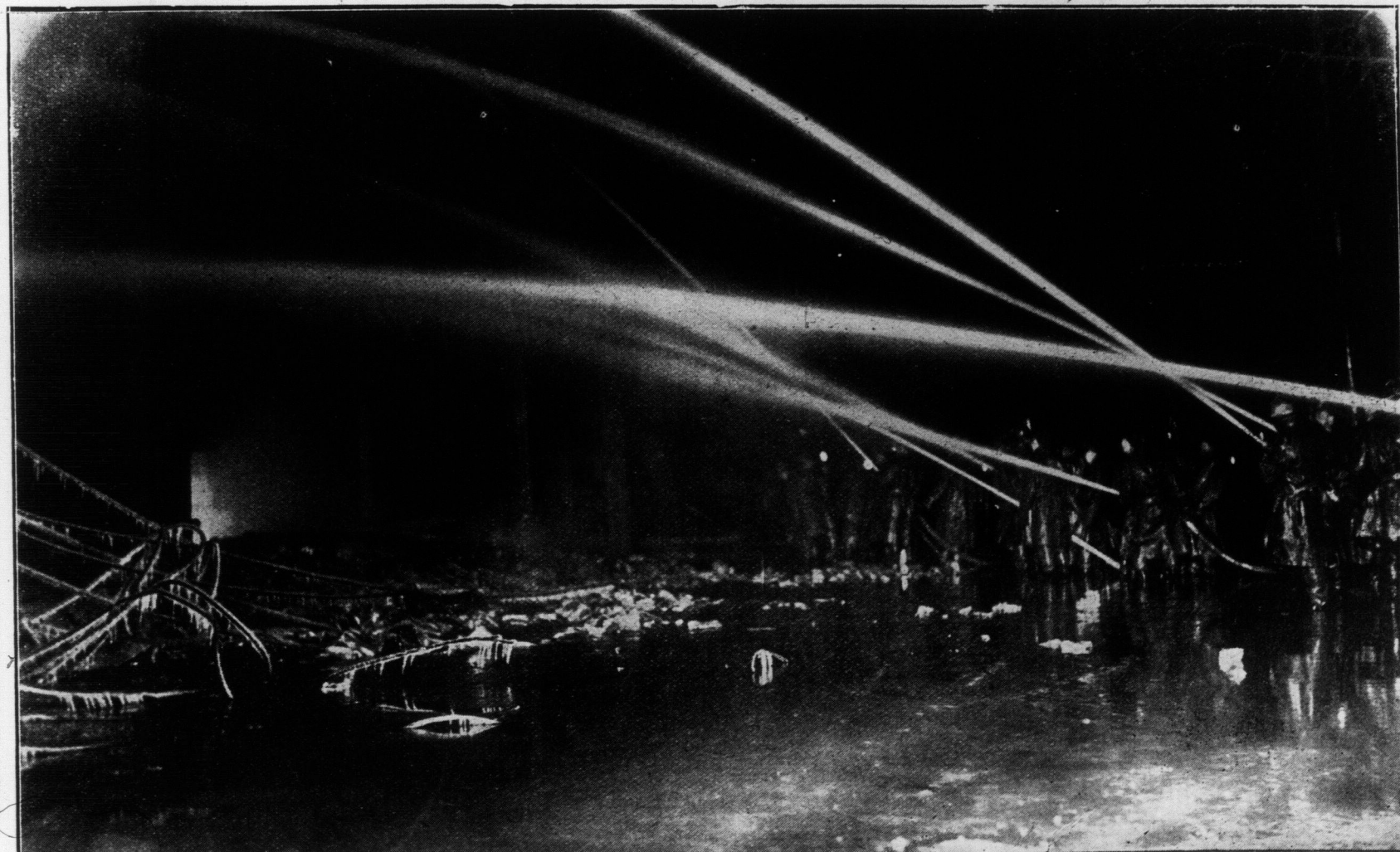
ONE OF THE MOST UNUSUAL NIGHT PICTURES TAKEN IN TORONTO. A FLASHLIGHT BY THE SUNDAY WORLD PHOTOGRAPHER AT THE $285,000 BLAZE IN THE INDEPENDENT CLOAK COMPANY BUILDING ON WEST RICHMOND STREET.