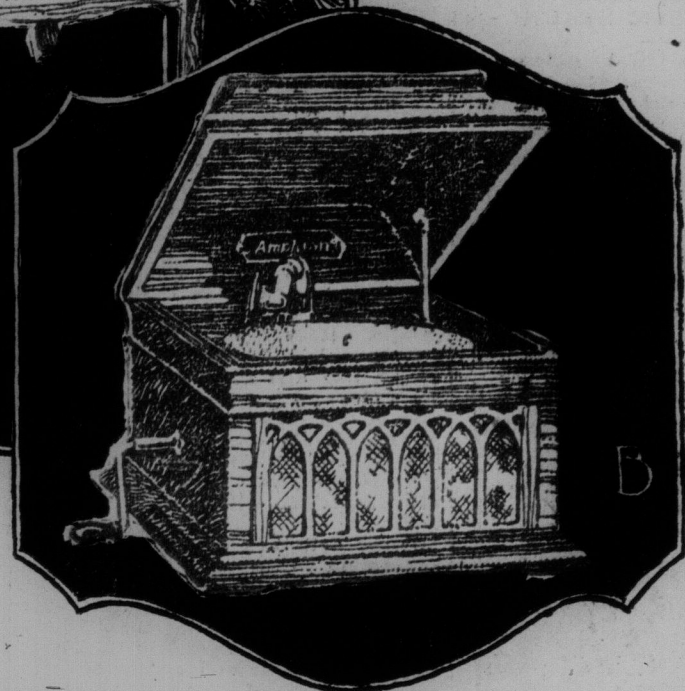
"Amphion" Model No. 2 Special $50.00

A. Amphion model No. 3—Fumed oak or mahogany cabinet, size 40 1-2 inches high x 19 1-4 inches wide x 20 1-2 inches deep. Improved nickel-plated reproducer, with universal tone arm; 12-inch turn-table; tone control; graduated speed regulator and three-ply all-wood tone chamber. Record compartments for five albums, each with a capacity of twelve records. Newly designed Meiselbach double spring motor (can be wound while playing). Special price, $75.00.