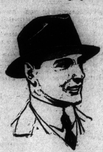
Fifth Ave. $2.00