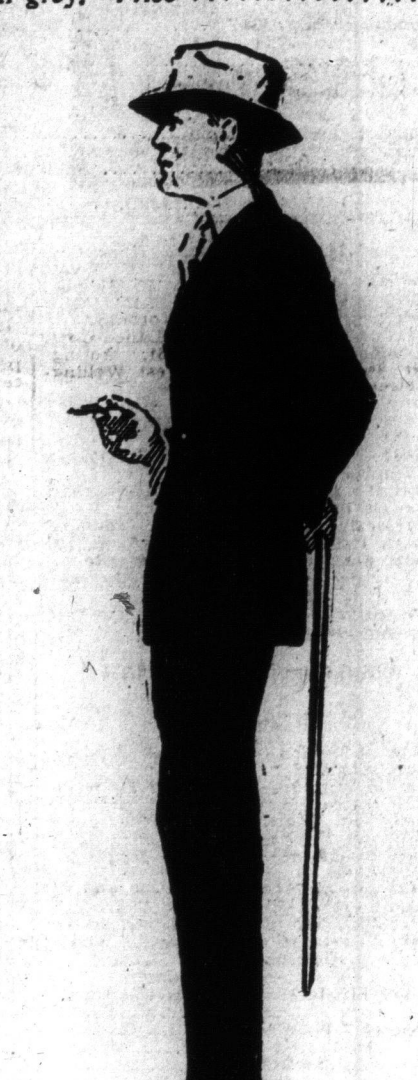
A Complete Display of Fall and Winter Underwear for Men

"Wolsey," "Ceetee," "Penangle," "Tiger," "Mercury" and other Reliable English and Canadian Brands