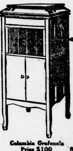
Columbia Grafonola Price $100 65