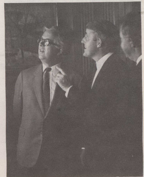
From left: Sir Geoffrey Howe with Brian Mulroney and Joe Clark in Ottawa.

During the private meetings, Mr. Clark stressed that both "unity and movement" on the South African situation were essential at the Commonwealth conference. Mr. Howe said that Britain was "ready to listen to what