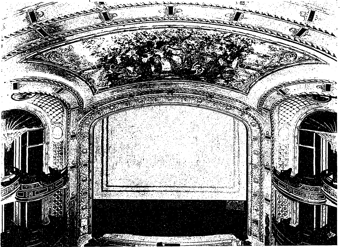
VIEW OF STAGE, NEW PRINCESS THEATRE, MONTREAL.