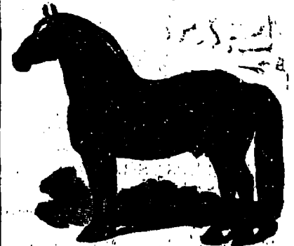
Patrols No. 222 (117).